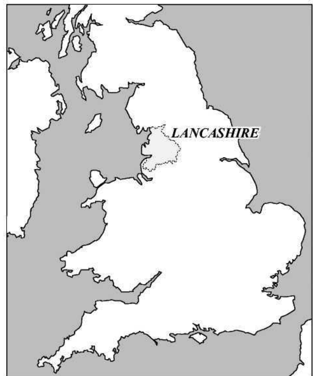
Fig. 11.1: Lancashire.

Such an approach, in which the whole of an area of landscape is assessed and characterised, is in line with methodologies of landscape assessment undertaken for non-historical reasons. The general purpose of these has been defined by the Countryside Agency (Countryside Commission 1993; 1998; Countryside Agency 1999) as