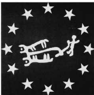
European Pathways to Cultural Landscapes