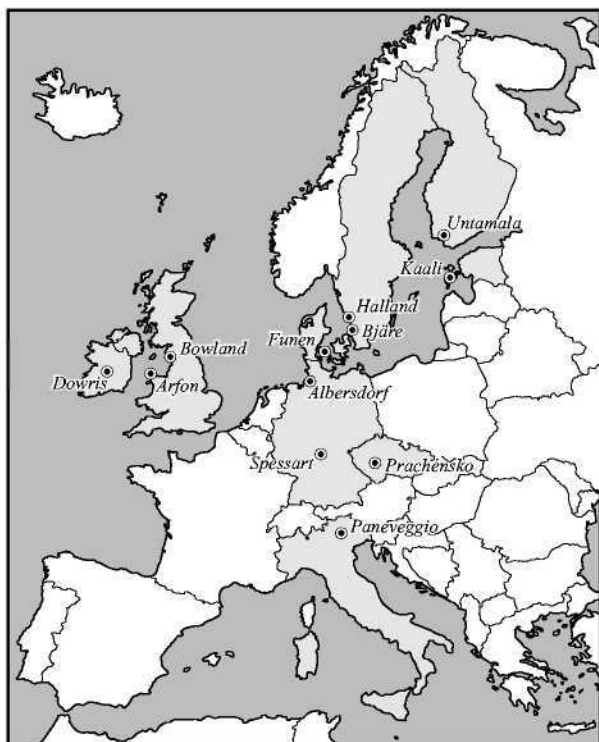
Fig.11.4: Map showing the location of the EU Pathways Projects.

common as part of Europe. The project is in two parts. Firstly, the different European cultural landscapes are linked together through common leaflets and folders, a shared Website, a major publication, six seminars, two exchanges per project, and educational work. The seminars will be used to target problems, issues and the exchange of ideas and experiences.